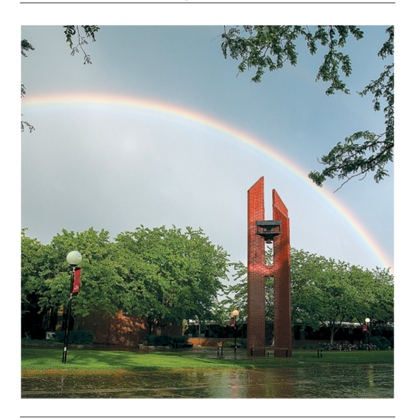
Approved by the NWC Board of Trustees on November 14, 2022