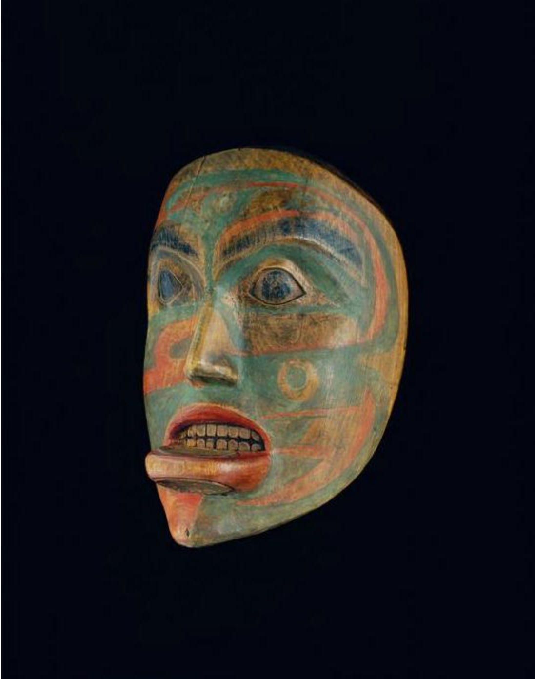
Figure V. Human Face Mask with Labret.