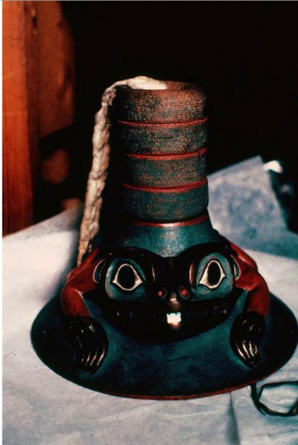
Figure IV. Example of Ceremonial Crest Wear- Frog Clan Hat.