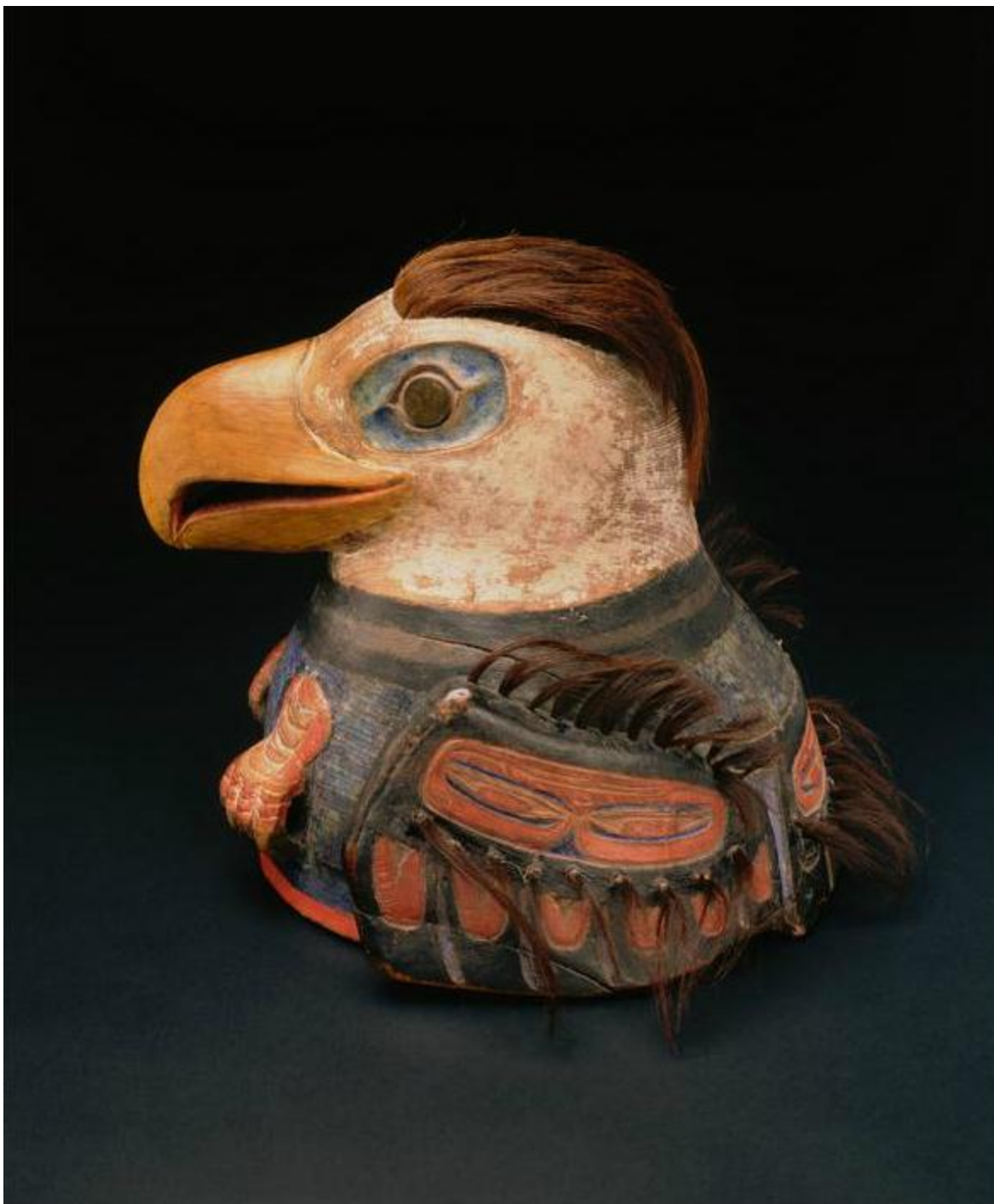
Figure III. Tlingit Eagle War Helmet.